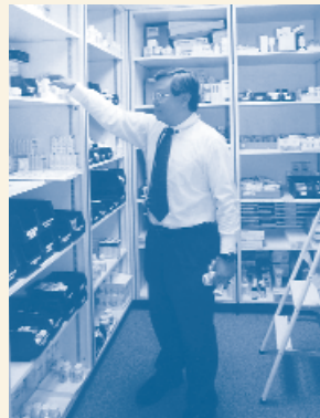
Asian Pacific Health Care Venture

Medpin’s Drug Distribution Project (DDP) recently completed its final Order Period for Program Year 2, sending $60 million worth of orders from more than 150 participating safety net clinics in California to participating pharmaceutical companies. These companies are shipping brand name drugs at no cost to community clinics, county health systems, and other California safety providers participating in the DDP. In addition to the nineteen major drug companies already participating, the DDP is pleased to welcome six new participant companies offering a total of $23 million of their brand name drugs: G.D. Searle, Hoechst Marion Roussel, Novartis, Roche Laboratories, Ortho-McNeil and Janssen.